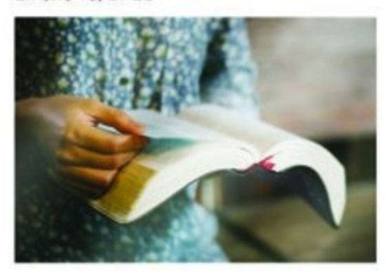
Excerpts from the Lectionary for Mass 52001, 1998, 1970 CCD. The English translation of Psalm Responses from Lectionary for Mass 8 1969, 1981, 1997, International Commission on English in the Liturgy Corporation. All rights reserved.

Is 40:1-5, 9-11/Ps 104:1b-2, 3-4, 24-25, 27-28, 29-30 (1)/Ti 2:11-14; 3:4-7/ Lk 3:15-16, 21-22