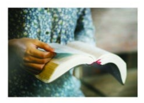
Excerpts from the Lectionary for Mass #2001, 1998, 1970 CCD. The English translation of Psalm Responses from Lectionary for Mass # 1969, 1981, 1997, International Commission on English in the Liturgy Corporation. All rights reserved.

Mal 3:1-4/Heb 2:14-18/Ps 24:7, 8, 9, 10/ Lk 2:22-40 or 2:22-32